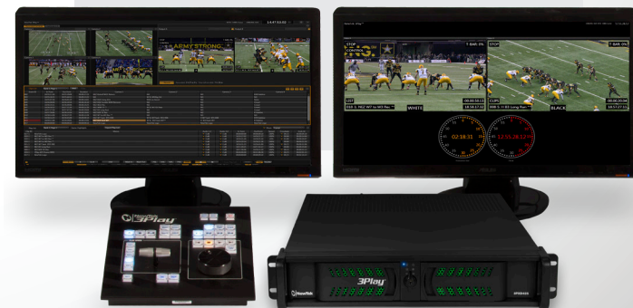
Monitors not included. Control Surface optional.