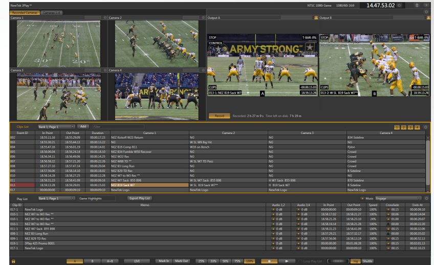
3Play 425 User Interface